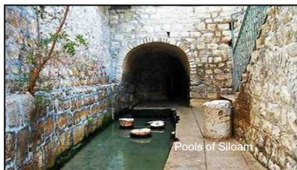
"So that the works of God may be known" Jn 3:9

A Visit to Bethlehem Archeological Dig City of David & the Pools of Siloam