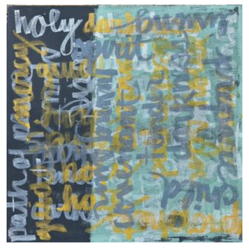
Zechariah's Song, Nicki Lang