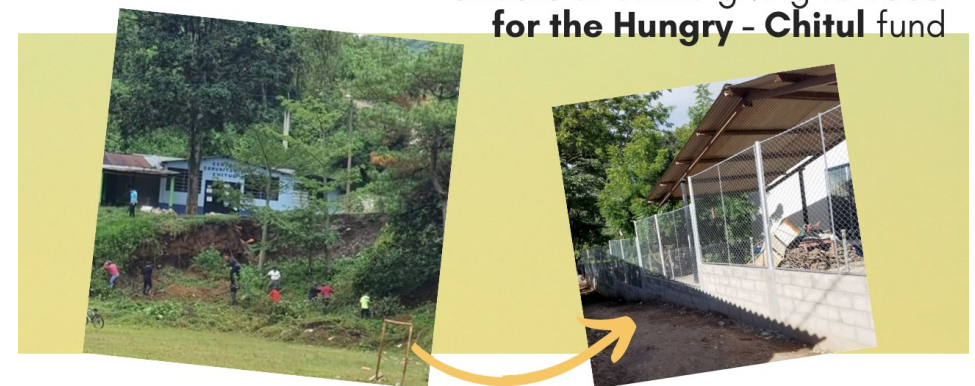
Project site and example of another retaining wall built in Chitul.

Checks or online giving to Food for the Hungry - Chitul fund