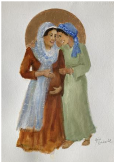
Elizabeth's Song, Gini Bunnell